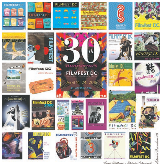
Collage by Alexis Thornlow