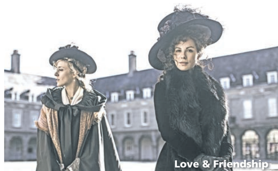
Love & Friendship