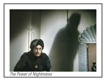
otherwise has been unavailable in the United States, has been uploaded in a variety of places (a practice Curtis has encouraged with this and other work of his, including The Trap ). The documentary, which draws connections between the rise of neoliberals in the United States and Muslim extremists worldwide, was originally shown on the BBC after an internal controversy. It has been taken up as a cause célèbre by some critics of U.S. and British

In some cases makers clip out sections of or reproduce entire works in online video as an act of rescue, because the makers believe that unavailability of this material is effectively an act of censorship or is simply wrong. For instance, most of British journalist Adam Curtis's